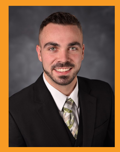
Colorado Donated Dental Services (DDS) is a program of Dental Lifeline Network, a national humanitarian organization and charitable affiliate of the ADA, providing access to comprehensive dental care for people with disabilities or who are elderly or medically fragile and have no other way to get help. Nationally, almost 15,000 dentists and 3,500 laboratories volunteer for DDS.