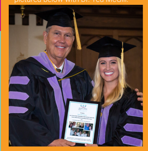
South Carolina Donated Dental Services (DDS) is a program of Dental Lifeline Network, a national humanitarian organization and affiliate of the ADA, providing access to comprehensive dental care for people with disabilities or who are elderly or medically fragile and have no other way to get help. Nationally, 15,000 dentists and 3,500 laboratories volunteer for DDS.