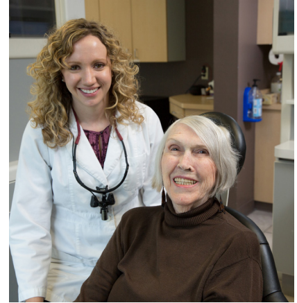
DDS Volunteer with DDS Patient

“Thank you so much. I am now able to smile without covering my mouth.”